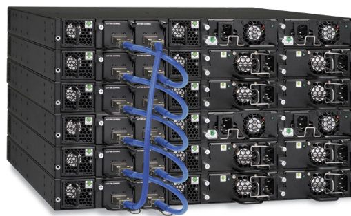
Figure 1: Up to 12 Brocade ICX 7450 switches can be stacked together using two full-duplex QSFP+ 40 Gbps ports that provide a fully redundant backplane with 960 Gbps of stacking bandwidth.

Deployed as a standalone switch, a stack, or a network fabric, organizations reap the benefits of a flexible platform and the assurance that their investments are protected.