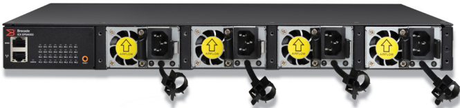
Figure 2: Ruckus ICX-EPS 4000 for the Brocade ICX 7250, shown with four AC power supplies.

The optional Ruckus ICX-EPS 4000 is an external power supply source that delivers additional power for up to 16 Brocade ICX 7250 switches (see Figures 2 and 3). It can be used for system power redundancy and an increased PoE/PoE+ power budget to enable additional ports.