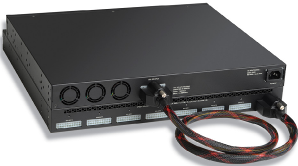
Figure 3: Rear view of the Ruckus ICX-EPS 4000 connectivity.