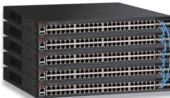
Figure 1: Up to 12 Brocade ICX 7250 Switches can be stacked together using up to four full-duplex SFP+ 10 Gbps ports for a fully redundant backplane with 480 Gbps of aggregated stacking bandwidth.

Designed for small to medium-size enterprises, branch offices, and distributed campuses, these scalable edge switches deliver enterprise-class functionality at an affordable price—without compromising performance and reliability. The Brocade ICX 7250 delivers wire-speed, non-blocking performance across all ports to support latency-sensitive applications, such as real-time voice/video streaming and Virtual Desktop Infrastructure (VDI). The switch is available in 24- and 48-port 10/100/1000 Mbps models with 1 GbE uplink or 10 GbE dual-purpose uplink/stacking ports (see Figure 1)—with or without PoE and PoE+—to support wireless mobility, and IP communications without the need for additional power outlets or power injectors.