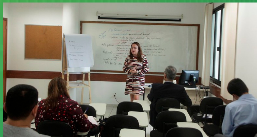
ESMAM'S CLASSROOM