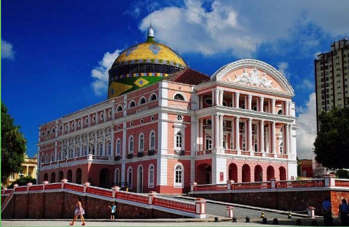
AMAZON THEATER