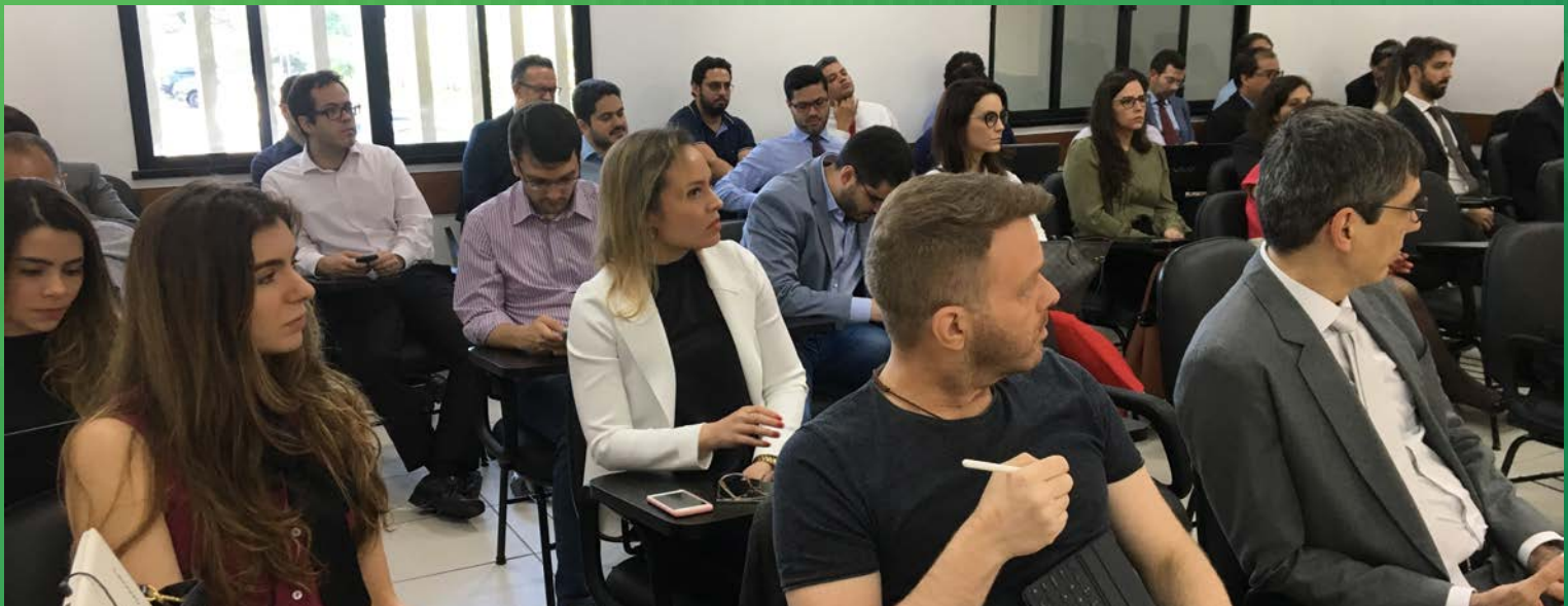
ESMAM'S CLASSROOM

The format of the courses can be on-site, distance or semi-presential, with a practical focus and use of case studies.