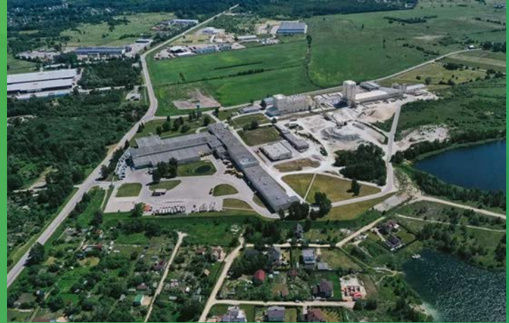
ZONA FRANCA DE MANAUS

The city of Manaus is the main economic, political and demographic center in Northern Brazil. It is located in the middle of the Amazon Forest, a biome of great biodiversity. It is the most important capital of the state and the main hub for trade and services in northern Brazil.