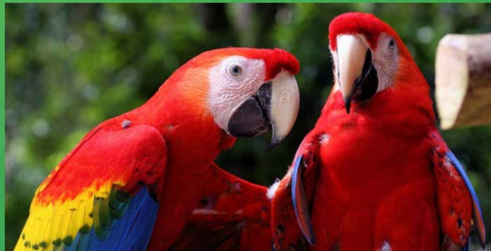
ARARA DA AMAZÔNIA