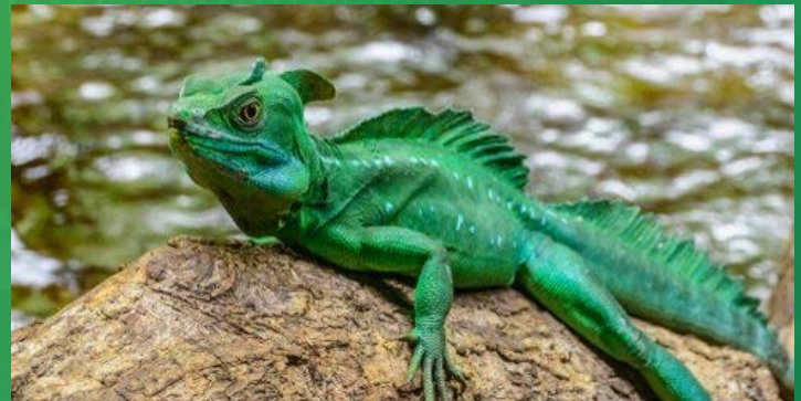
GREEN IGUANA