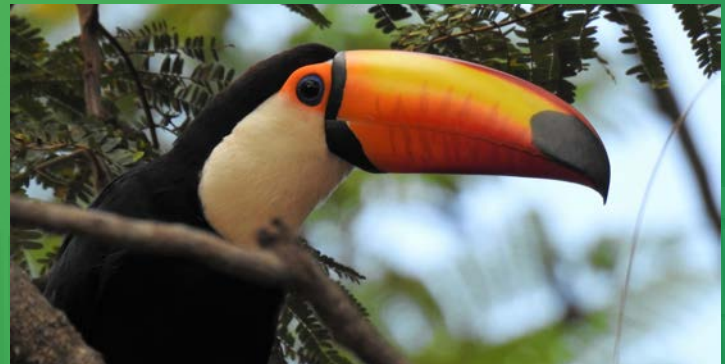
TOUCAN