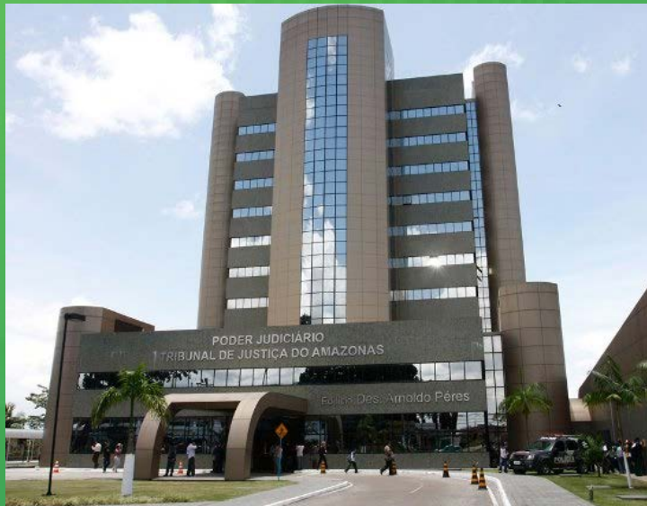
AMAZONAS COURT OF JUSTICE

The headquarters are in Manaus, where the second degree of the court of justice operates, in addition to administrative units.