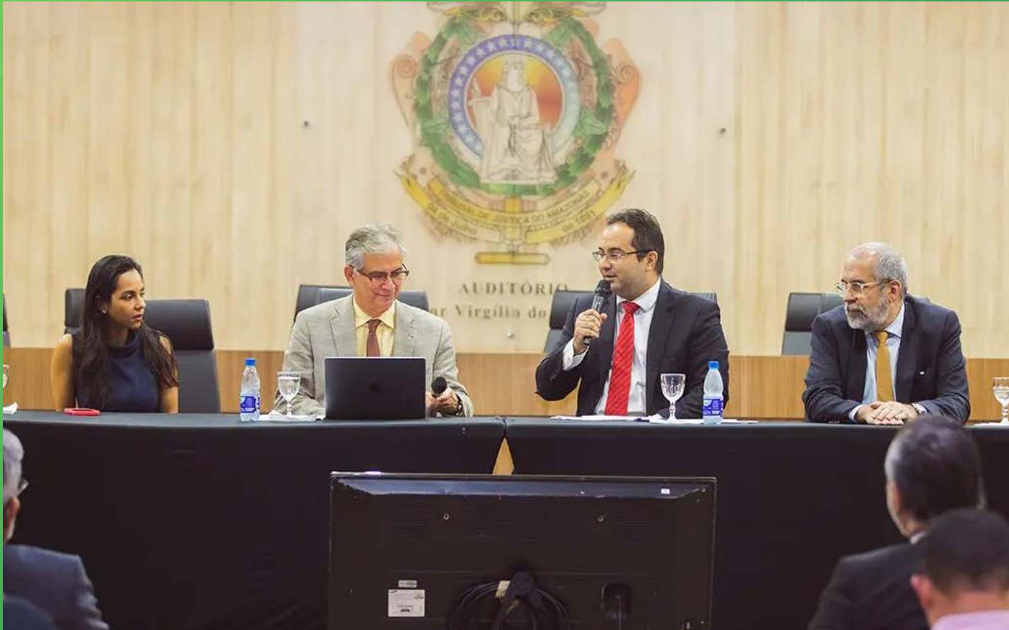
AUDITORIUM

ESMAM PROMOTES DEBATE ON LAW AND TECHNOLOGY