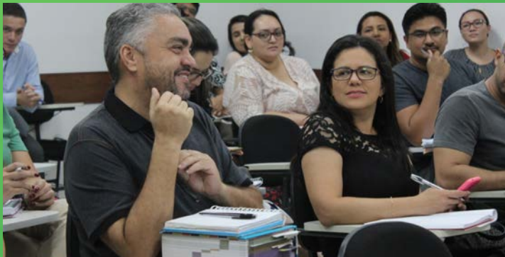
ESMAM'S CLASSROOM

Thus, it has been seeking, through partnerships, to offer postgraduate courses such as specialization, master's and doctorate degrees.