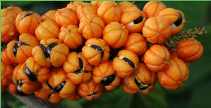
GUARANÁ DA AMAZÔNIA

According to the World Wide Fund for Nature Brazil (WWF Brazil), about 40,000 plant species have been scientifically classified in the biome; 427, from mammals; 1294, of birds; 378, of reptiles; 427, from amphibians; approximately 3 thousand species of fish; and about 128,840 species of invertebrates.