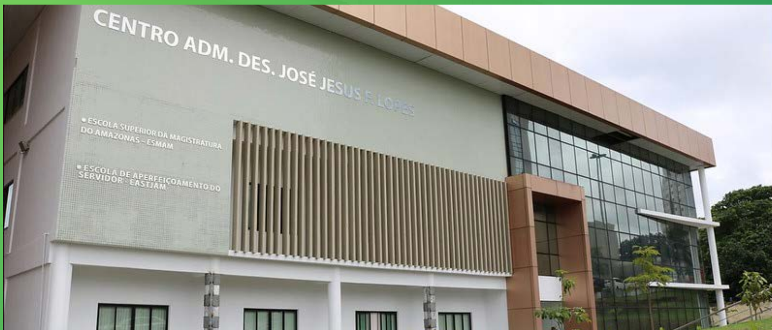
ADMIN CENTER DES. JOSE JESUS F. LOPES

The Amazonas Superior School of Magistrates (ESMAM) was created by Complementary Law No. 17, of January 23, 1997. It began its activities in 1999, with classes from the Preparatory course for the Career of the Magistrate, in a historic building located in the center of the city .