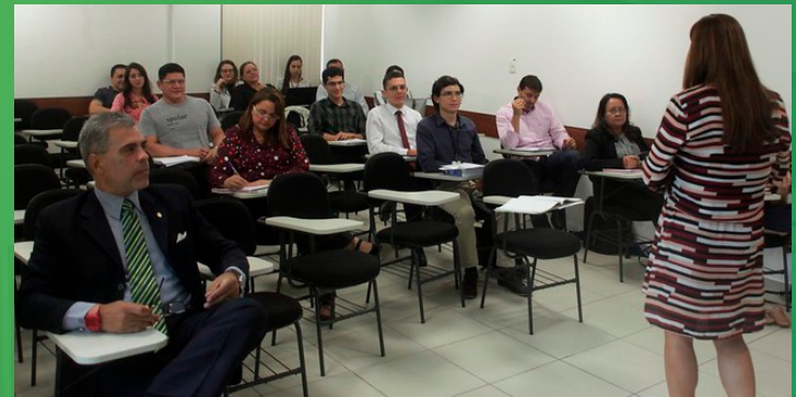
ESMAM'S CLASSROOM