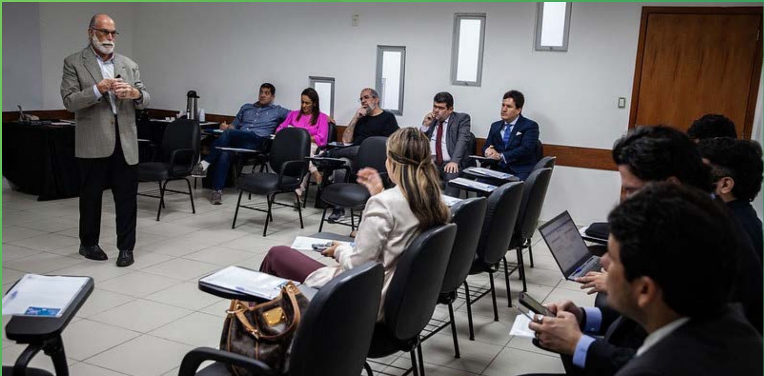
ESMAM'S CLASSROOM

The Training of Trainers course (FOFO), is focused at magistrates of the Court of Justice of Amazonas (TJAM) and members of other institutions of the Justice System, the course seeks the pedagogical qualification of teachers who work in Judicial and Magistracy Schools. It is carried out in partnership with the National School for Training and Improvement of Magistrates (Enfam), offering subsidies for teaching activities, considering the particularities of the target audience and the practical impact of learning activities on the daily life of the profession of judges.